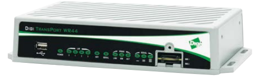
Digi TransPort® WR44 R