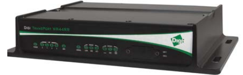
Digi TransPort® WR44 RR