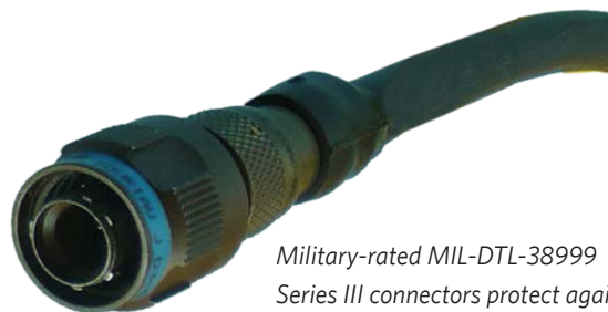
Military-rated MIL-DTL-38999 Series III connectors protect against vibration, shock, water and more.