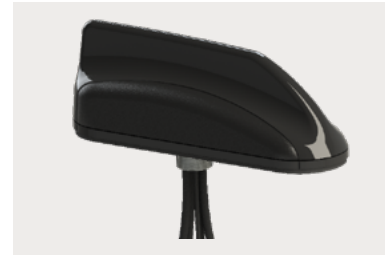
3 - i n - 1 M u l t i b a n d A N T E N N A