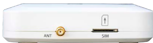
DIGI CONNECT® IT MINI LEFT